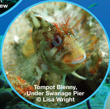
Tompot Blenny, Under Swanage Pier