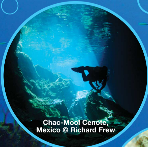
Chac-Mool Cenote, Mexico