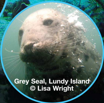
Grey Seal, Lundy Island